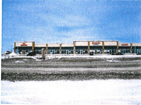
1750 Square Feet or more Retail/Peace Road Crossings Across from New Jewel Development