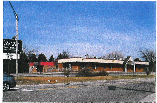
Offices/Retail/Restaurant 900-2500 Square Feet Across from New Kishwaukee Hospital