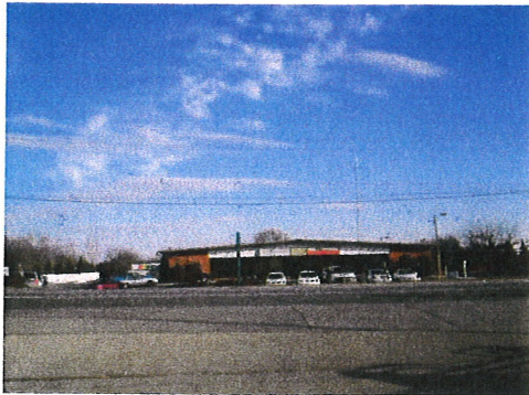
Offices/Barnaby Business Center Show Room with Loading Dock Available