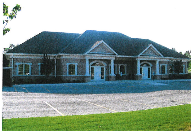
New Construction 1550 to 3100 Square Feet Finished Space with Full Basement Aberdeen Court

Call Michael Carpenter, CCIM today to locate your business! 815-540-5101